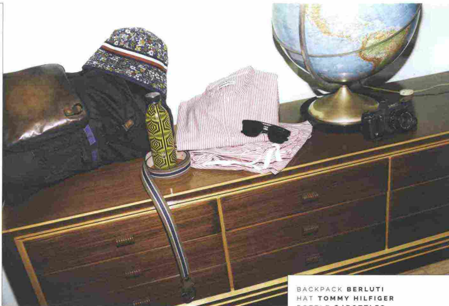
BACKPACK BERLUTI HAT TOMMY HILFIGER BOTTLE 24BOTTLES BELT SALVATORE FERRAGAMO PAJAMAS BONJOUR & BONNE NUIT SUNGLASSES SALVATORE FERRAGAMO

50'S FURNITURE AND ILLUMINABLE GLOBE BY DE AGOSTINI, 1966